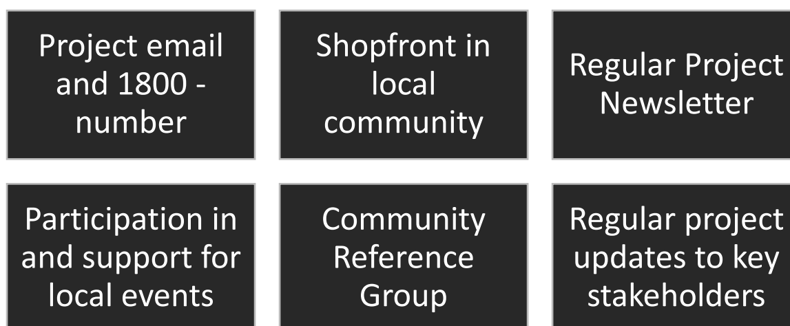
Figure 3 Elements of the community engagement program

The project's community engagement program will contain both passive and active methods, as well as avenues for information provision, consultation and participation. Figure 3 below shows the key elements of the community engagement program.